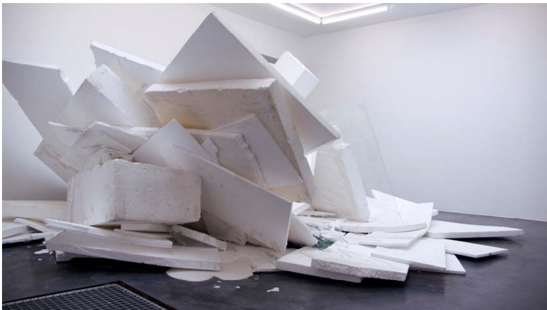
“IceCollapseAndCrack”, 2009, installation (polystyrene, glass, plaster).