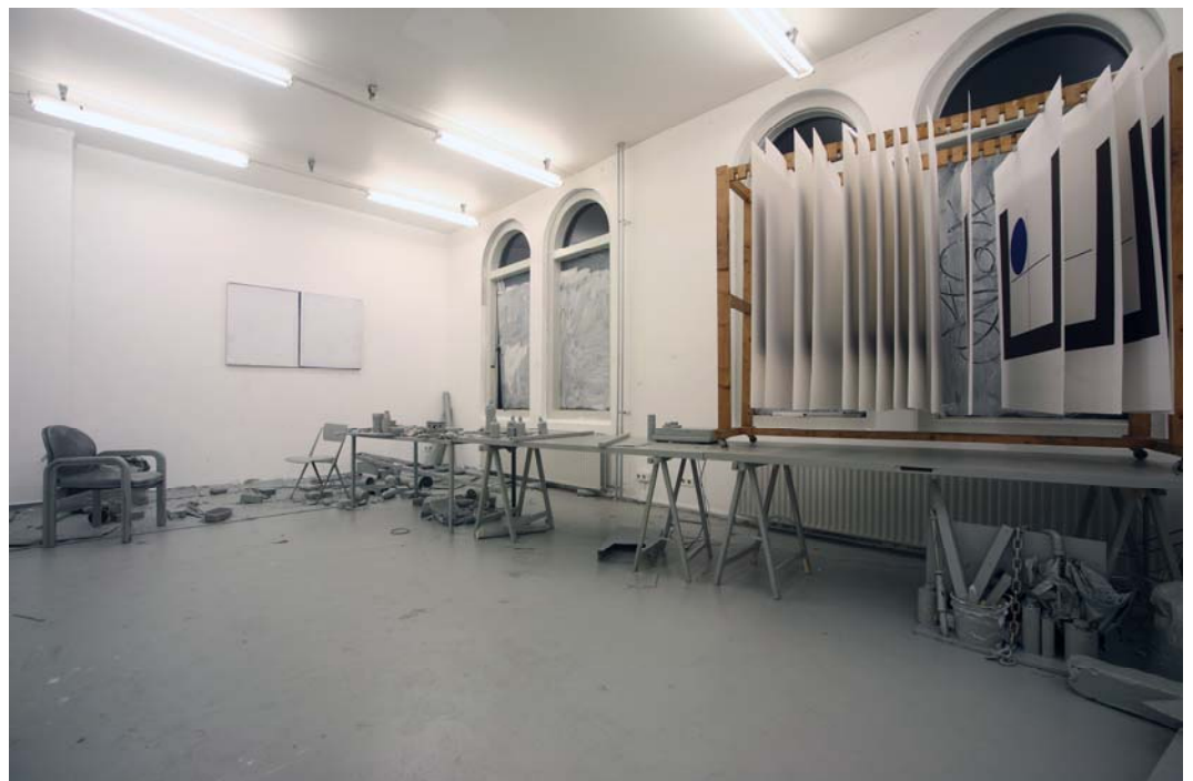
“Through the Windows”, 2009, installation (mixed medias).