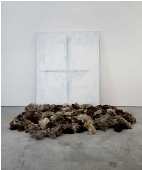
“Windows”, 2009, installation (encaustic on canvas and sheep wool)